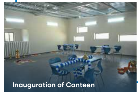
Inauguration of Canteen