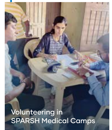
Volunteering in SPARSH Medical Camps

GMM Pfaudler Foundation under Project SPARSH 2.0 organized sensitization session for the employees. The session aimed to impart knowledge about the project and provide basic information on measuring various health parameters used in the during medical camps conducted by Mobile Health Teams (MHT). Following these sessions, employees actively volunteered in the MHT camps organized a in the villages.