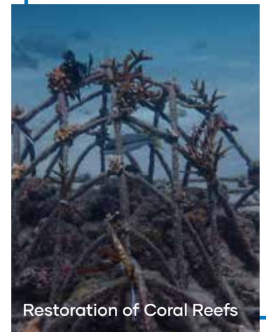
Restoration of Coral Reefs