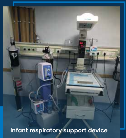
Infant respiratory support device

In FY24, the Foundation had a positive impact on over 30,000+ patients through its healthcare initiatives