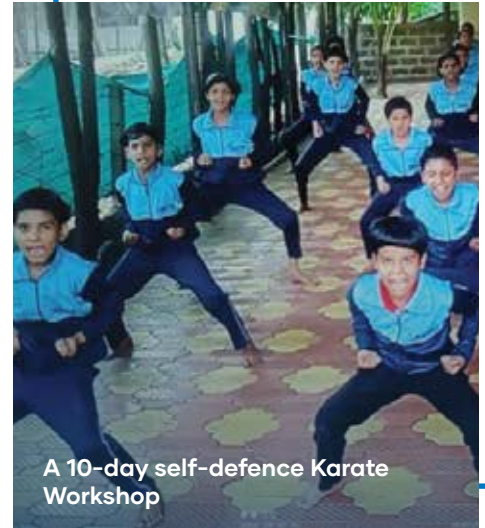
A 10-day self-defence Karate Workshop

As part of their recreational activities, children were given sports shoes for a cricket match to encourage their participation in a tournament and boost their confidence. This initiative fosters an inclusive and joyful environment, promoting active involvement and fair play.