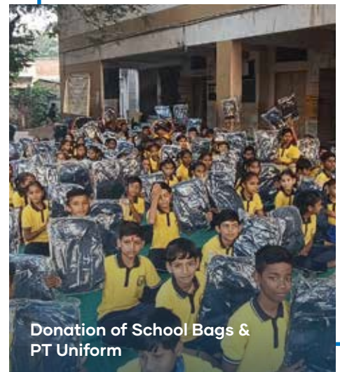
Donation of School Bags & PT Uniform

GMM Pfaudler Foundation has upgraded the sanitation and drinking water facilities at the school. Additionally, the Foundation has supported the students by providing school bags and PT uniforms.