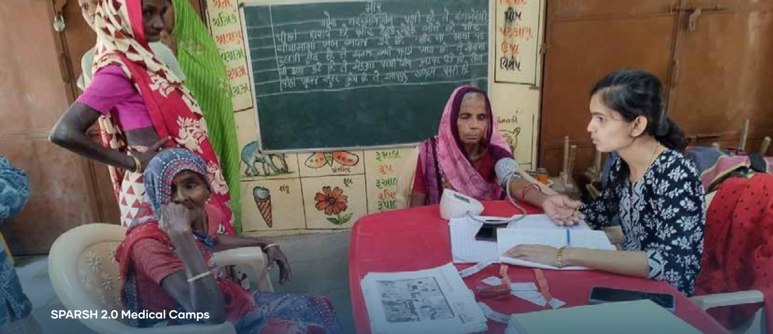
SPARSH 2.0 Medical Camps