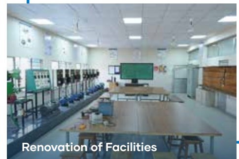
Renovation of Facilities

To create an enriching and pleasing environment for the students, the Foundation organized a tree plantation drive at JV Patel ITI. As part of this initiative, about 1000 saplings were planted by the students. These saplings are closely monitored to ensure a high survival rate and healthy growth.