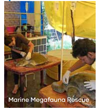
Marine Megafauna Rescue