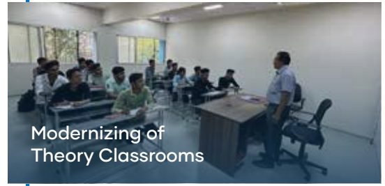
Modernizing of Theory Classrooms

Among various employment skills & awareness workshops, the Foundation also organized an awareness session in collaboration with Project SPARSH on the consequences of consumption of Tobacco and Alcohol which was attended by 250+ students and staff members of the institute thus enabling students to make informed decisions & cultivate a well- rounded approach to personal development.