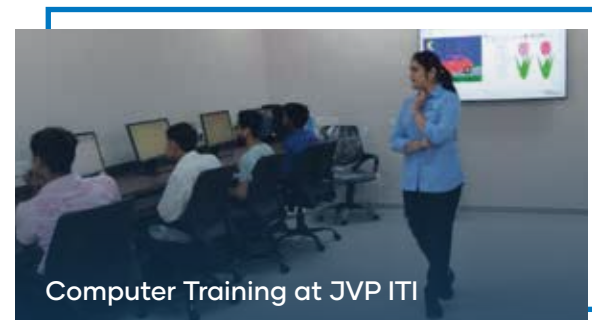
Computer Training at JVP ITI