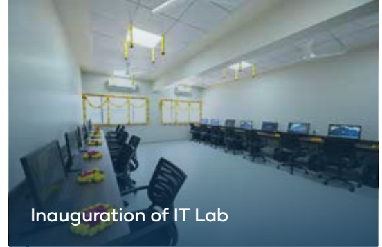
Inauguration of IT Lab