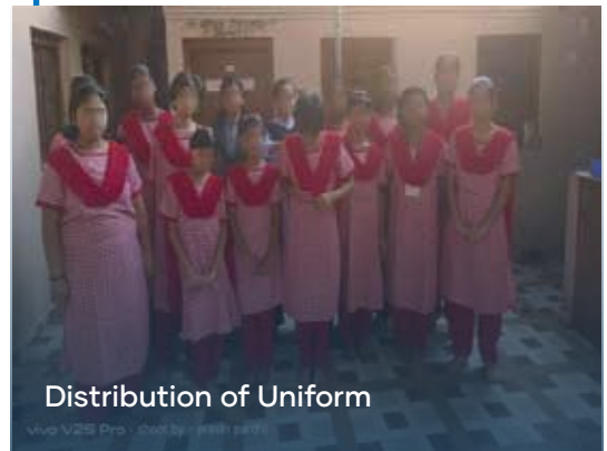
Distribution of Uniform

As part of capacity-building, training sessions on Child Protection Policy were organized for CCI staff.