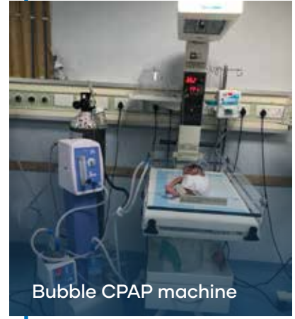
Bubble CPAP machine

In addition to the four-equipment donated in FY23, the Foundation has donated a Bubble CPAP, Two Infant Radiant Warmers, a Blood Gas Analyzer, Coagulation Analyzer and Towel & Fluid warming system. These equipment enable healthcare professionals to oversee and monitor the healthcare of mothers as well as the new borns.