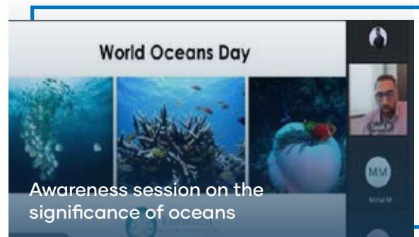
Awareness session on the significance of oceans