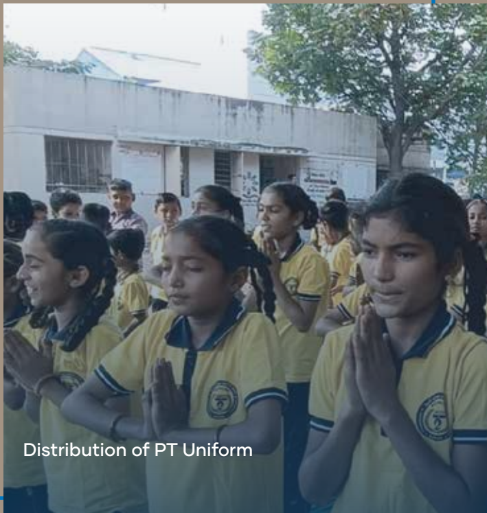
Distribution of PT Uniform