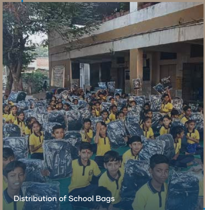
Distribution of School Bags

GMM Pfaudler Foundation has taken up the initiative to install two water filters and water cooler systems with an aim to provide sustainable solution for clean and safe drinking water for the students.