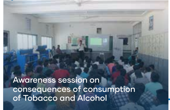
Awareness session on consequences of consumption of Tobacco and Alcohol