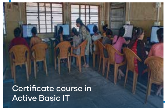
Certificate course in Active Basic IT